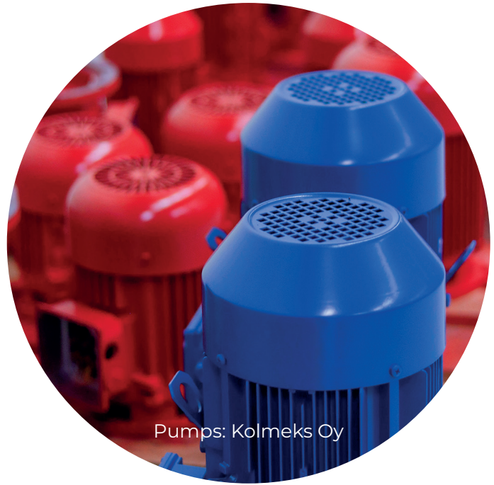
Pumps: Kolmeks Oy

Updated Technical Data Sheet (TDS) and Safety Data Sheet (SDS) and our general conditions of sales are available at www.nor-maali.fi . In case of differences in information: the order of priority of information is TDS and SDS over any other information.